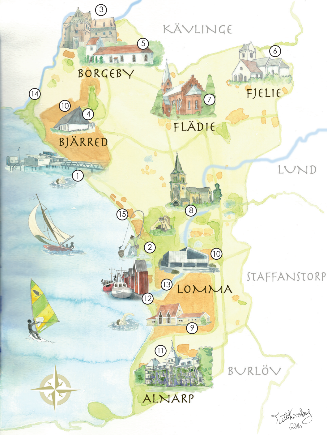
Illustration: Mette Koverberg